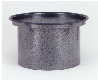
Activated Carbon Cartridge - Optional