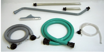
ARU STD Tools and Accessories - Included