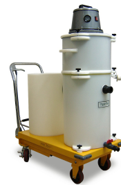
2D-ARU-15 STD (HY-C) MRAC