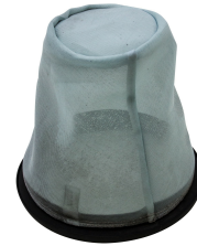
Liquid Filter - Included